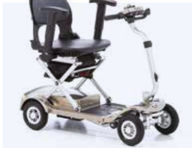
Kymco K-lite Folding Scooter FE Auto Fold Max weight capacity: 120kg Max speed: 4mph Max range*: 9 miles