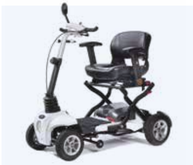
TGA Maximo Plus Max weight capacity: 113kg Max speed: 4mph Max range*: 12 miles