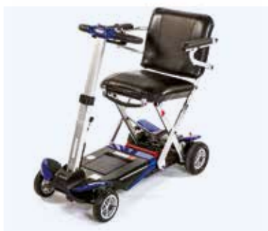
Monarch Smarti Plus Max weight capacity: 135kg Max speed: 4mph Max range*: 10 miles