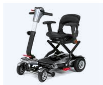
TGA Minimo Autofold Max weight capacity: 115kg Max speed: 4mph Max range*: 10 miles