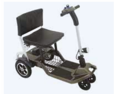
One Rehab Qfold Max weight capacity: 115kg Max speed: 4mph Max range*: 10 miles