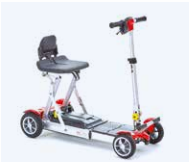
Motion Healthcare mLite Max weight capacity: 115kg Max speed: 4mph Max range*: 9 miles

These are made with a light frame, are ideal for short journeys and fold down, to fit into a car.