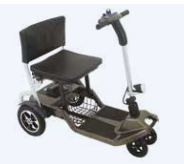
One Rehab Qfold Max weight capacity: 115kg Max speed: 4mph Max range*: 10 miles