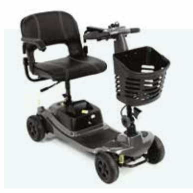
One Rehab Liberty Vogue Max weight capacity: 136kg Max speed: 4mph Max range*: 10 miles