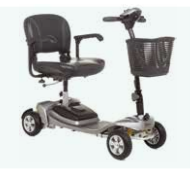
Motion Healthcare Alumina Pro Max weight capacity: 115kg Max speed: 4mph Max range*: 30 miles