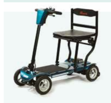
Monarch Air Plus Max weight capacity: 125kg Max speed: 4mph Max range*: 15 miles