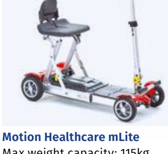
Max weight capacity: 115kg Max speed: 4mph Max range*: 9 miles

These are made with a light frame, are ideal for short journeys and fold down, to fit into a car.