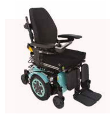
Invacare TDX2 SP-Modulite M10 Max weight capacity: 150kg Max speed: 6mph Max range*: 24 miles

These are more complex chairs, with additional features and advanced seating options available.