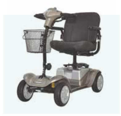
Kymco Mini Comfort Max weight capacity: 127kg Max speed: 4mph Max range*: 16 miles