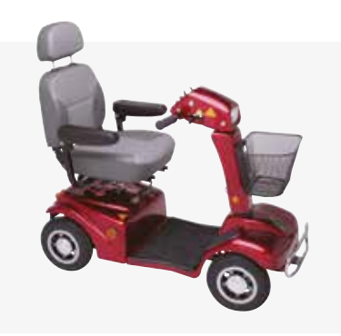
Rascal 388 XL Max weight capacity: 136kg Max speed: 6mph Max range*: 20 miles