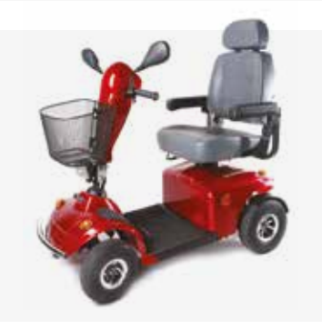
Freerider Mayfair 4 Max weight capacity: 133kg Max speed: 4mph Max range*: 20 miles