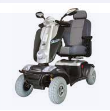
Kymco Maxi XLS Max weight capacity: 200kg Max speed: 8mph Max range*: 35 miles