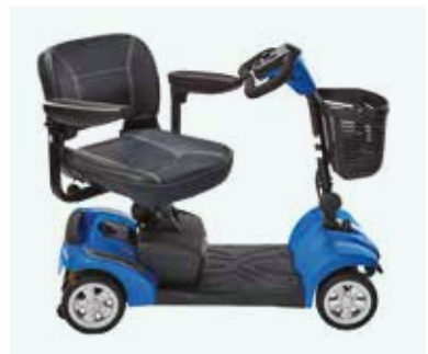
Electric Mobility Veo Sport LiFe Max weight capacity: 130kg Max speed: 4mph Max range*: 10.5 miles