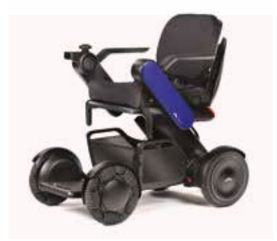
TGA Whill Model C2 Max weight capacity: 113kg Max speed: 4mph Max range*: 10 miles