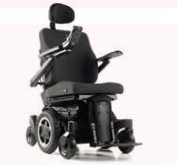
Sunrise Medical Quickie Q500-M 10kph Sedeo ProSeating Lift&Tilt Max weight capacity: 160kg Max speed: 6mph Max range*: 32 miles