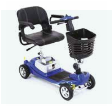
One Rehab Illusion Max weight capacity: 115kg Max speed: 4mph Max range*: 10 miles