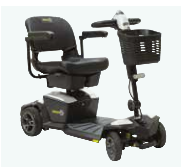
Pride Jazzy Zero Turn Max weight capacity: 136kg Max speed: 4mph Max range*: 13 miles