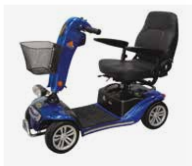
Roma Medical Valencia Max weight capacity: 135kg Max speed: 4mph Max range*: 20 miles