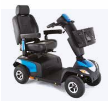
Invacare Orion Pro 4w Max weight capacity: 160kg Max speed: 8mph Max range*: 32 miles