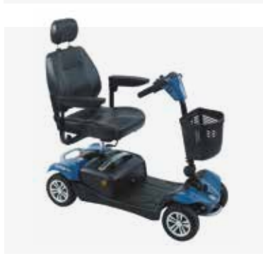
Electric Mobility Rascal Vista DX Max weight capacity: 140kg Max speed: 4mph Max range*: 35 miles