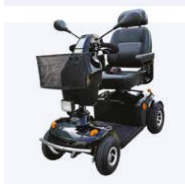
Freerider Mayfair 8 Deluxe Max weight capacity: 136kg Max speed: 8mph Max range*: 20 miles