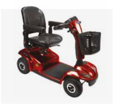
Invacare Leo Max weight capacity: 136kg Max speed: 4mph Max range*: 22 miles