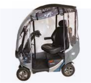
Electric Mobility Rascal Vortex Heavy Duty solid Canopy, vinyl sides/back Max weight capacity: 180kg Max speed: 8mph Max range*: 34 miles