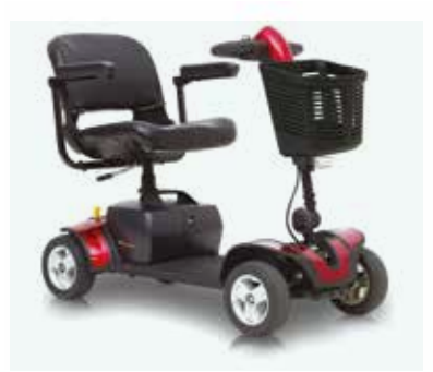
Pride Elite Sport Max weight capacity: 147kg Max speed: 4mph Max range*: 12 miles