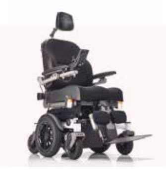
Dietz Power SANGO advanced MWD powered lift & tilt 6mph Max weight capacity: 160kg Max speed: 6mph Max range*: 20 miles