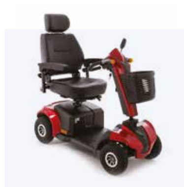
Monarch MM8 Max weight capacity: 160kg Max speed: 8mph Max range*: 25 miles

These are ideal if you travel long distances, on the road or pavement.