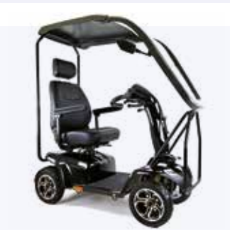
One Rehab Komfi Rider Alpine with Solid Canopy Max weight capacity: 181kg Max speed: 8mph Max range*: 35 miles