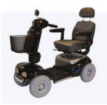
Roma Medical Shoprider Cadiz Max weight capacity: 136kg Max speed: 8mph Max range*: 20 miles