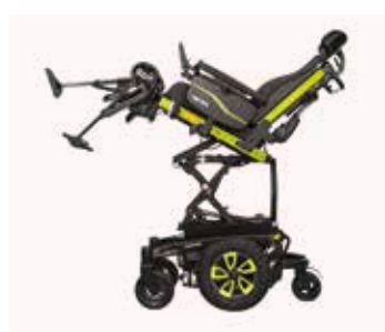
Electric Mobility Meyra Orbit MWD Power Lift & Tilt 4mph Max weight capacity: 160kg Max speed: 4mph Max range*: 25 miles