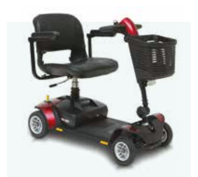
Pride Go-Go Elite Traveller 4 12amp Max weight capacity: 136kg Max speed: 4mph Max range*: 10 miles

These are made with a light frame and come apart to make them easier to store or transport.