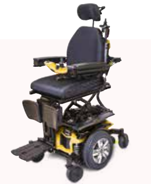
Quantum Q6 Edge 2.0 TB3 Seat iLevel Tilt Pwr Recline Max weight capacity: 136kg Max speed: 6mph Max range*: 15 miles