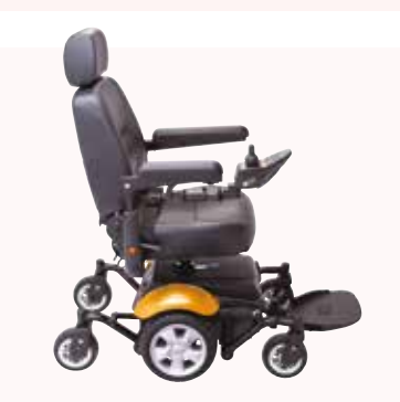
Electric Mobility Rascal Ryley Max weight capacity: 136kg Max speed: 4mph Max range*: 22 miles