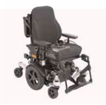
Otto Bock Juvo B6 MWD Tilt Max weight capacity: 140kg Max speed: 6mph Max range*: 21 miles