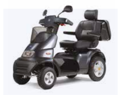
TGA Breeze S4 Long Range Battery Max weight capacity: 200kg Max speed: 8mph Max range*: 30 miles