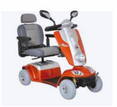
Kymco Midi XLS Max weight capacity: 160kg Max speed: 8mph Max range*: 25 miles